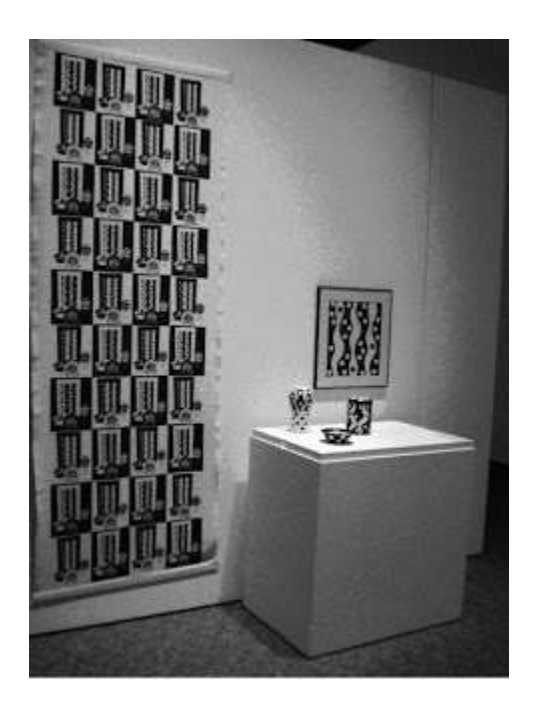
Installation view of Black and White Polka Dot grouping at BAC

Entering the Lee-Chin Family Gallery at the Burlington Arts Centre in October 2011, I entered a time portal that didn't take me to another place in time but rather brought thirty years to me.